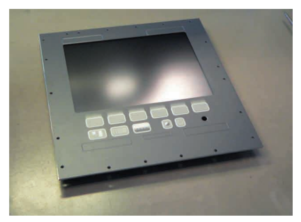
Note! If front glass is damaged this is very unconvenient to repair in field. We recomend to change the complete front plate with overlay and front glass